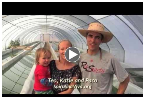
Spirulina Viva Mexico