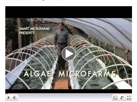
Algae Microfarms Book 1:49 minutes