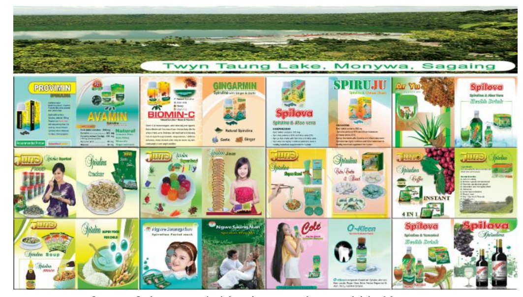
Some of the remarkable algae products sold in Myanmar.

with spirulina: food supplements, functional foods and beverages, personal care products and cosmetics, biofertilizer and beer.